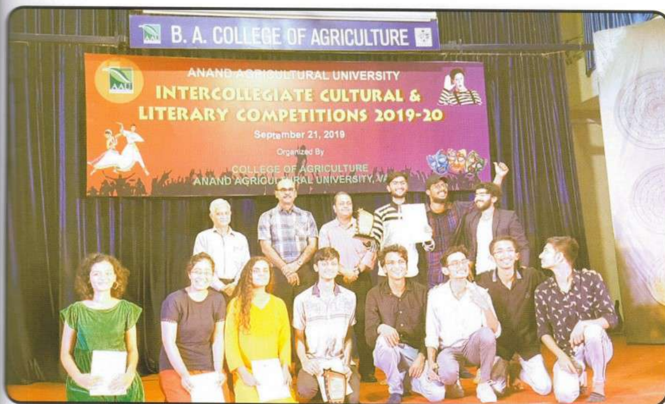
Organisation of Intercollegeiate Cultural Competitions